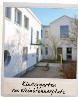
Kindergarten am Weinbrennerplatz