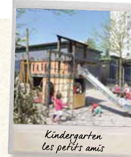
Kindergarten les petits amis