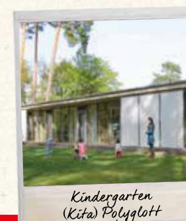
Kindergarten (Kita) Polyglott