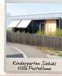
Kindergarten SieKids Villa Pustebume