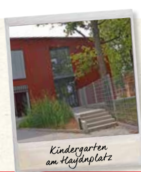
Kindergarten am Haydnplatz