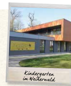
Kindergarten im Weiherwald